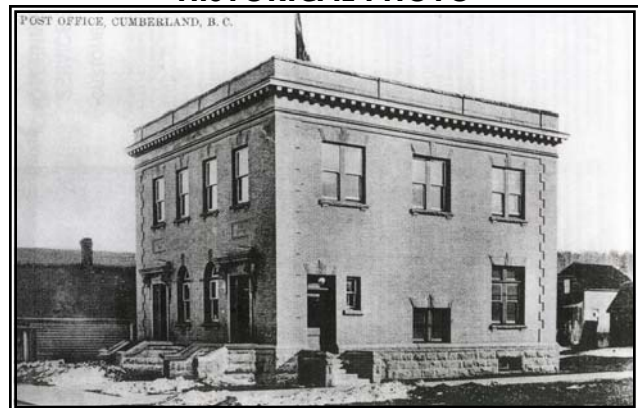
Picture of the building as it stood in 1907.